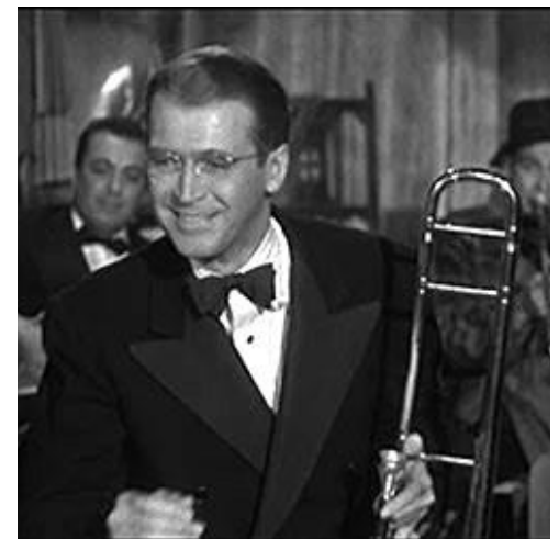
Stewart appearing in the postwar box office hit, The Glenn Miller Story .