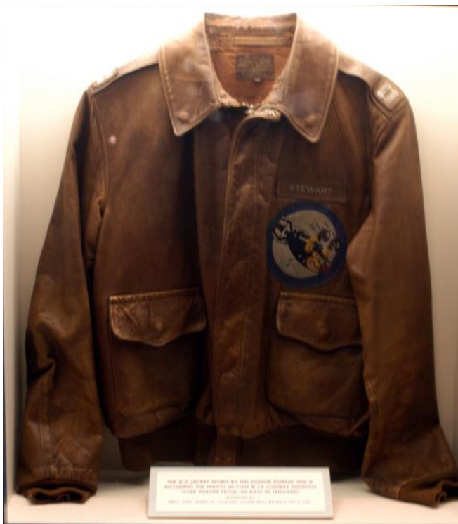
DAYTON, Ohio -- Brig. Gen. James Stewart's jacket is on display with the Celebrities in Uniform exhibit in the World War II Gallery at the National Museum of the United States Air Force.

It is easy to sit in comfortable chairs around a blackboard after a mission and say what a leader should or should not have done when faced with so awful a dilemma as confronted Stewart – a situation, incidentally, which illustrates perfectly the kind of decisions our air commanders had to face every day.