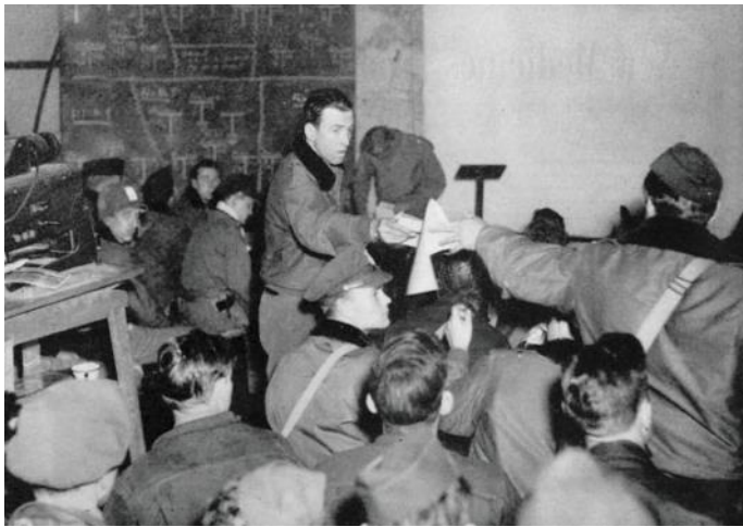
Jimmy Stewart during briefing for D-Day missions, June 6, 1944.

Within ten days, probably a record for a newly arrived group, the 445 th put up a twelve-ship formation on a mission at 27,000 feet against Kiel, Germany, with no losses. Captain Stewart led the high squadron. On all the subsequent eighteen missions which he flew during sixteen